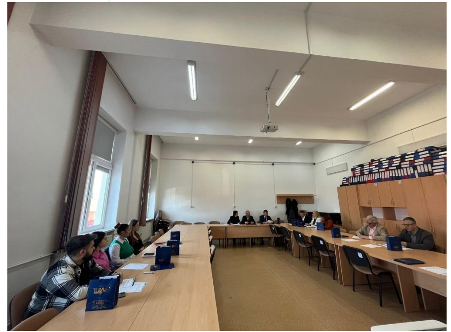
Photos taken during the audit sessions